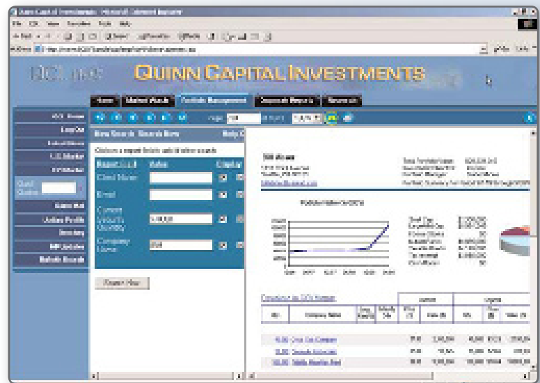
SmartSearch is just one of the interactive features automatically available with e.Reports that enables users to find the exact business information they need.

can drill down into detailed information, across data fields for context and scope, and up for the “big picture,” with no restrictions on the number of levels. Users can even drill across reports to review related information.