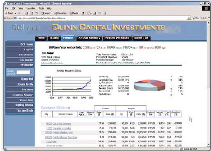
DHTML e.Reports offer resolution that's sure to please your users.

Page-Level Security Option —Actuate's Page Level Security Option enables end-users to issue a single query to receive secure, personalized views of information contained in a single document. This serves to minimize the number of reports that must be created and managed, thereby reducing administrative overhead while enabling end-users to receive highly personalized information.